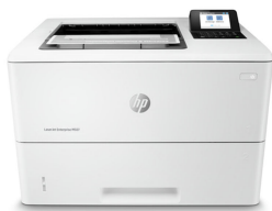
HP LaserJet Enterprise M507dn