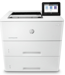
HP LaserJet Enterprise M507x